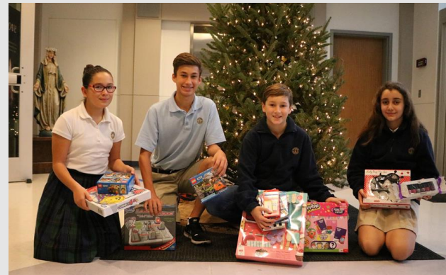
Families donated nearly 300 new toys to Children's Memorial Hermann Hospital during our Christmas Toy Drive. The toys were gifted to children receiving long term care as part of the hospital's Christmas celebrations.

In the wake of Hurricane Harvey, our school community responded with open hearts and hands to our city in need. P.L.U.S. Cares and Concerns committee responded immediately to help the 15 school families and 5 teachers affected by the flooding. A network of support and assistance was established to ensure families were cared for. Donations provided included appliances and home goods, restaurant gift cards, and gently worn uniforms. St. Michael Catholic School's catering service, ECI, offered student lunches and take home dinners for families free of charge.