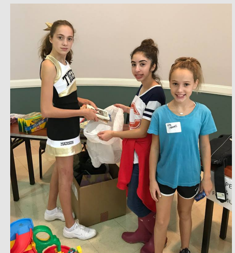
Donation drive held by St. Michael Catholic Church collected home goods, clothing, toiletries, and other necessities. Volunteers collected, sorted, and distributed the items to communities and organizations in need.