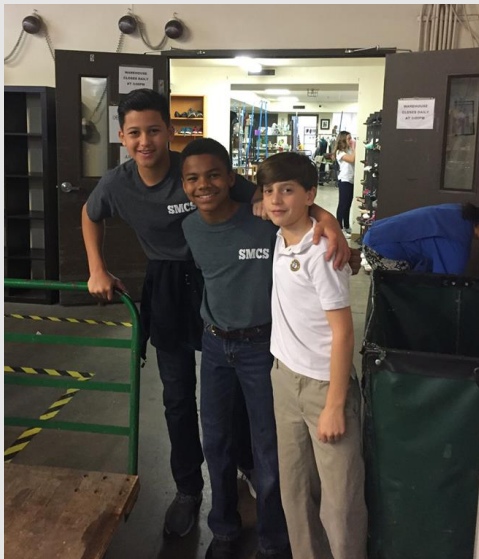
7th and 8th graders participated in several service projects throughout the year in partnership with local organizations. Pictured are 7th grade students volunteering at the St. Vincent de Paul Store.

Throughout the year, this spirit of generosity remained present in our students as they led and participated in opportunities to serve those in need. We are beyond proud of our students and their discipleship through service.