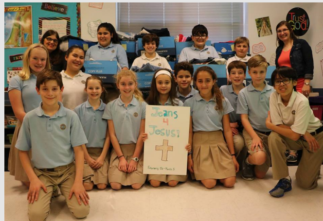
In March, students led a "Jeans for Jesus" clothing donation drive, collecting 320 pairs of jeans to be donated to Catholic Charities.