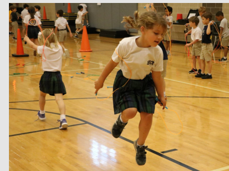
Students participated in Jump Rope for Heart, An American Heart Association Program (AHA), in April.

Coordinated by our P.E. Department, this annual event aims to raise awareness and funds in support of heart health. Fundraising participants raised a total of $6,530 for the AHA.